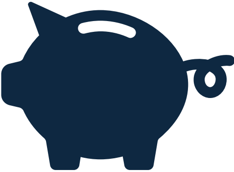
General Fund Long-Range Financial Forecast