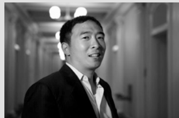
Andrew Yang Founder & CEO, Venture for America Author, Smart People Should Build Things